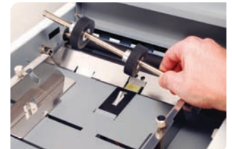
Ensure reliable feeding with easy maintenance feed wheels