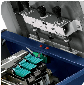
Print on items up to 3/8" thick or as large as 15" x 20".

Our patented HP printing technology produces true 600x600 dots per inch printed images. This means sharp, crisp, more easily readable addresses and professional appearance, with a print area of up to 3 inches. With the AS-960, you get a clear, consistent, machine-readable barcode that allows your document to fly through the Postal Service reading systems, increasing your productivity. It even lowers your printing costs.