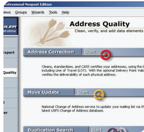
Neopost CASS™ compliant address quality management software certifies your mail for USPS® discounts and reduces your rate of returns.