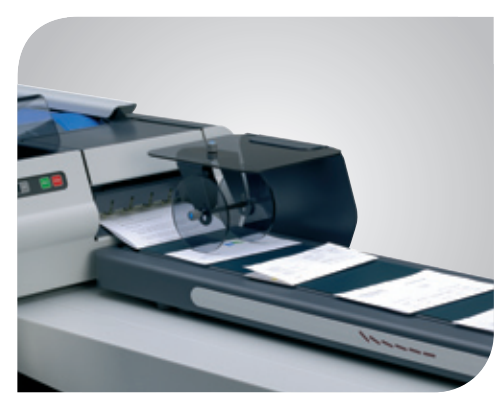
A convenient conveyor system can be added for additional hands-free productivity.