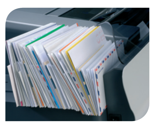
The IM-30/35 handles up to 300 pieces of mixed-size mail without presorting - just load the hopper and press start.