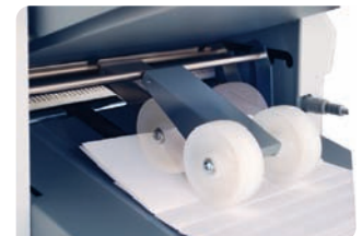
Automatically adjusting stacker wheels to accommodate various fold types