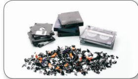
Shreds hard drives, magnetic tapes, CDs/DVDs, credit cards and USB sticks