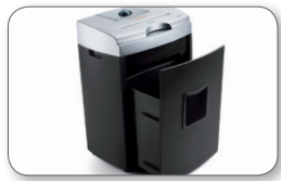
Removable waste container

shredstar document shredders are perfect for shredding sensitive documents at home or in small offices. User-friendly functions, excellent price/performance ratio and compact design allow you to shred securely and reliably.