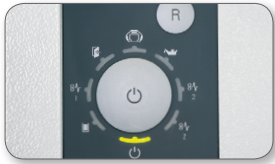
Continuous operation and low noise

The HSM Powerline models are the ideal solutions for destroying large archives or for use at central shredding points. Its sturdy technology has been especially designed for large throughput and long total operating times.