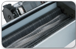
Continuous operation and low noise

SECURIO document shredders symbolize quality. Made in Germany, each one is precisely tailored to a specific requirement. The only thing that never changes is the first-class quality of our products.